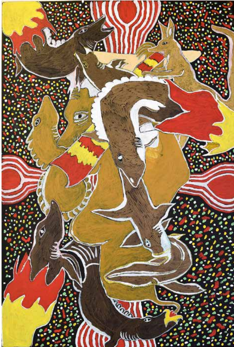
John Prince Siddon, "Sharks and Flowers", Acrylic on canvas, 120 x 120 cm.