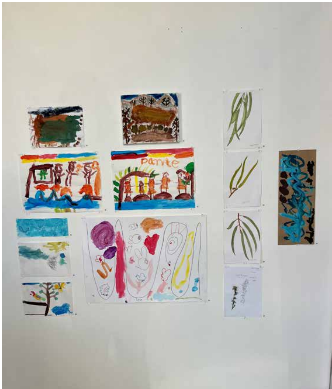
14. Suni Nishimura-Turner, The Rock-pool 2022 , watercolour on cardboard